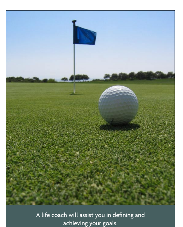
The client is willing to learn and to apply this knowledge in the pursuit of desired outcomes.

entions for appointments include in-per-